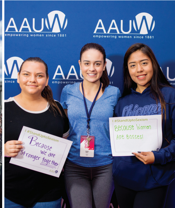
AAUW student leadership conference attendees