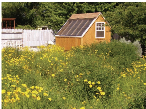
Wildflower Garden with Shed.